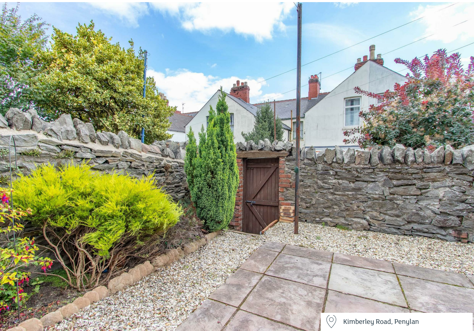
Kimberley Road, Penylan

Total Area: 1203 ft 2 ... 111.8 m 2 All measurements are approximate and for display purposes only